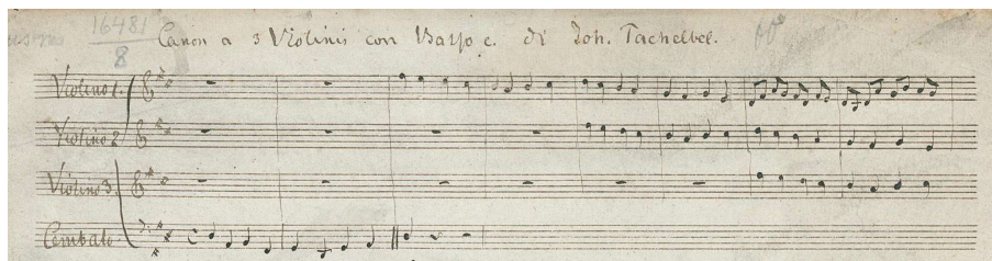
The opening measures of Johann Pachelbel's Canon in D

The six-note canon is the foundation of the work. The piece begins with the canon figure played unaccompanied in the bass during the first two measures. This figure is repeated 27 times over the course of the piece. Starting from measure three, the violins enter in succession in a "follow the leader" manner, each part an exact replica of the others. Although the audience technically hears the same violin part three times, the two-measure displacement between the parts results in an incredibly satisfying variety of texture and harmonies.